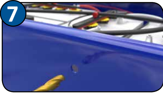
7 Mounting Option 1: To install the remote indicator first drill a 1/2" hole in the desired mounting location.