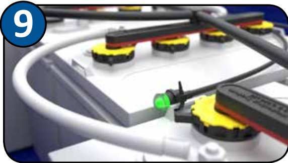
9 Mounting Option 2: The remote light may be mounted to a secure location inside the battery compartment.

Compatible with Flow-Rite® Pro-Fill™ single-point watering systems.