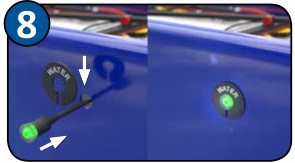
8 Feed the light through the hole and through the slot in the mounting plate. Snap the light into the plate, remove the adhesive backing and secure into place.