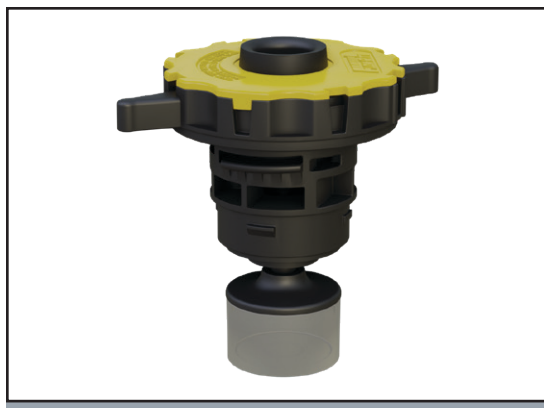
Patented shut-off valves replace vent caps.