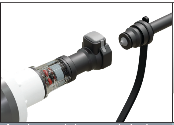
A water supply is connected using a quick coupler to fill batteries.