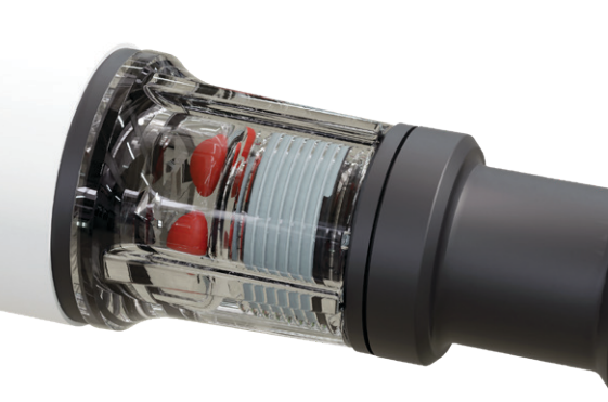
The patented flow indicator signals when to disconnect the coupler.