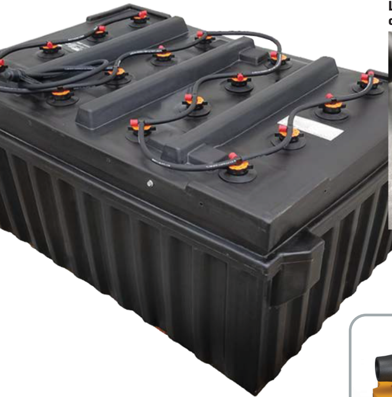
Low profile fits battery compartments